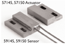
59145, 59150 Sensor