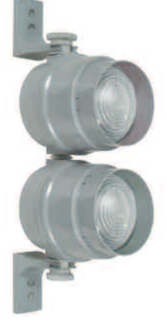
The fixing bow can be mounted pointing inwards or outwards