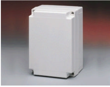
This is a sample photo.