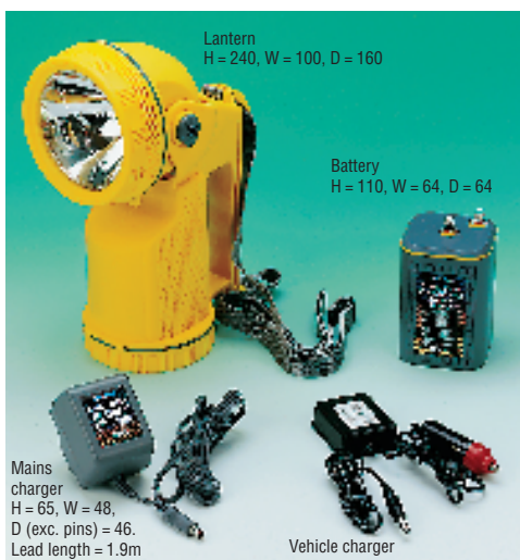
Lantern H = 240, W = 100, D = 160