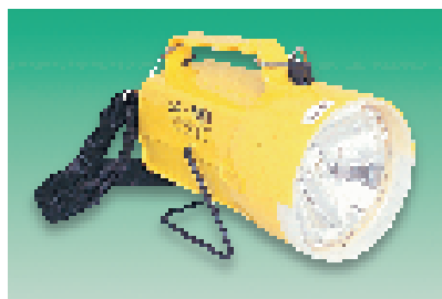
201-819 H = 140, W = 125, D = 220