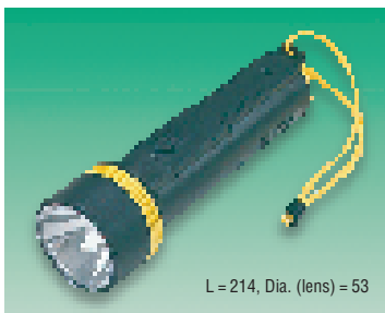
L = 214, Dia. (lens) = 53