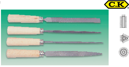
Blade length = 106, overall length = 172