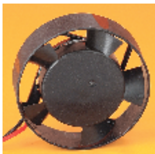
Dia = 39, D = 12