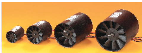
24mm 36mm 48mm 60mm