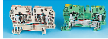
Feed Through Terminals Earth Terminals