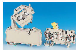
Fused Terminal Isolating Terminal